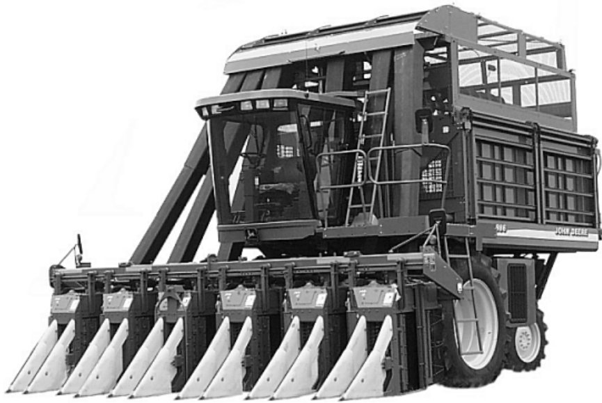
JOHN DEERE 9986 COTTON PICKER (MANUFACTURED 2002-2005)

(SPECIFICATIONS AND DESIGN ARE SUBJECT TO CHANGE WITHOUT NOTICE.)